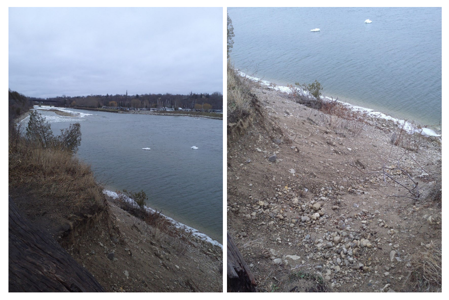
Panel 5. Looking towards Maitland River, including shallow bar (left). Shoreline substrate (right).