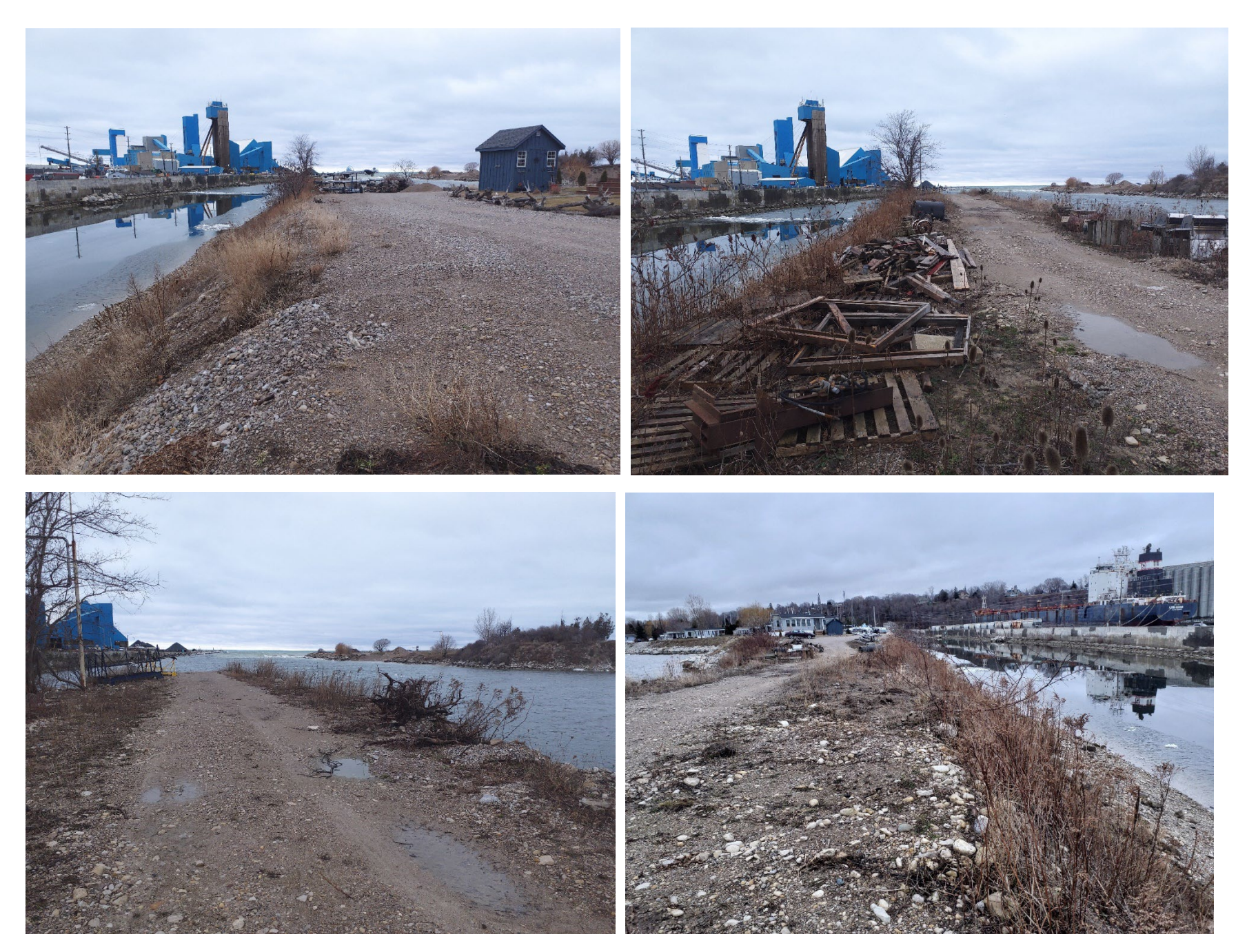
Panel 8. Confluence of access channel and Maitland River