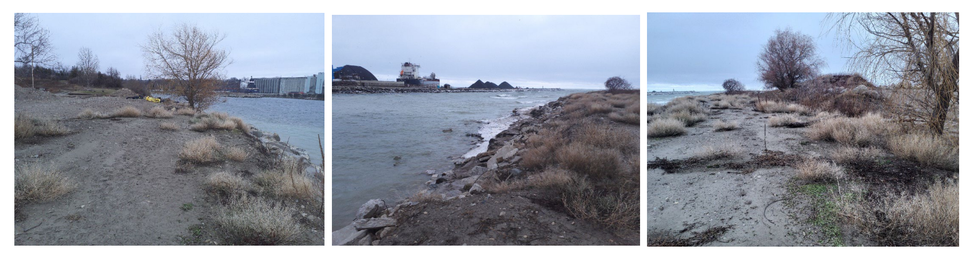
Panel 2. Rocky shoreline / beach area on north shore of the Maitland River, south of the Maitland Inlet Marina looking towards harbour break wall.