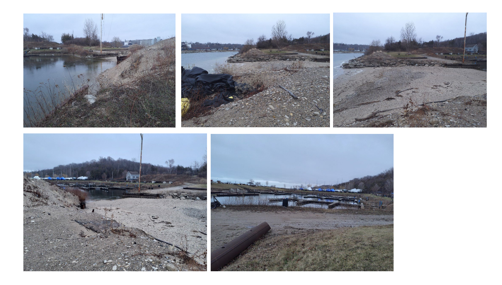
Panel 1. Entrance to the Maitland Inlet Marina basin, January 2023.