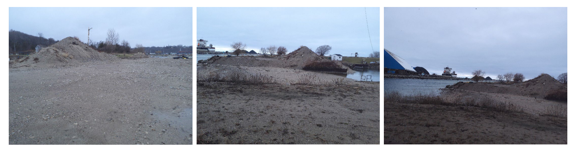
Panel 3. Dredged material offloading area, Maitland Inlet Marina.