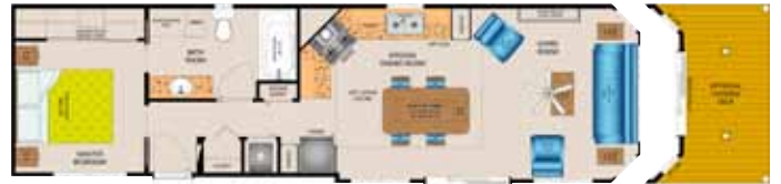
RIDGETOWN 1 - 18 (R4412 1BR FL) 537.7 SQ. FT.