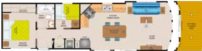
RUSTICO 2 - 18 (R4412 2BR TL) 537.7 SQ. FT.