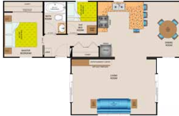
MAIDSTONE - 18 (F3712 2BR FD) 438 SQ. FT. + 213 SQ. FT.