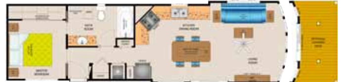
RUSTICO 1 - 18 (R4412 1BR TL) 537.7 SQ. FT.