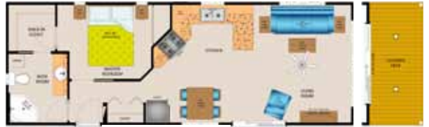
RAMSEY - 18 (R3914 1BR) 540 SQ. FT.