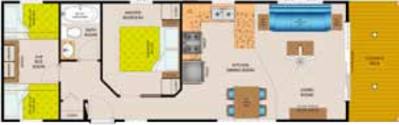
ROSEDALE - 18 (R3914 2BR FL) 540 SQ. FT.