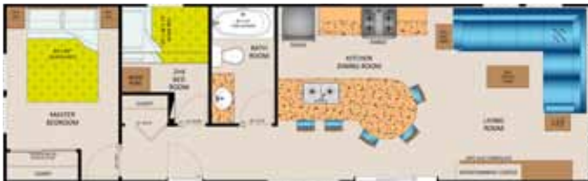
MARRIOTT - 18 (M4213 2BR) 453 SQ. FT.