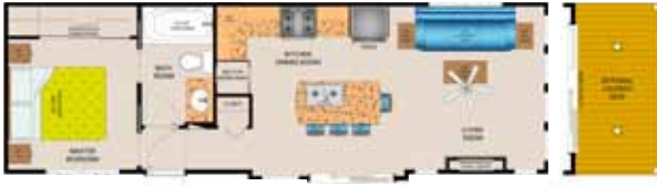
RUTHERFORD - 18 (R3812 1BRFL) 461.2 SQ. FT.