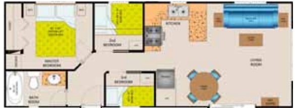
FLORENCE - 18 (F3714 3BR CK) 502 SQ. FT.