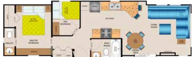
MELBOURNE - 18 (M4312 2BR) 534.5 SQ. FT.