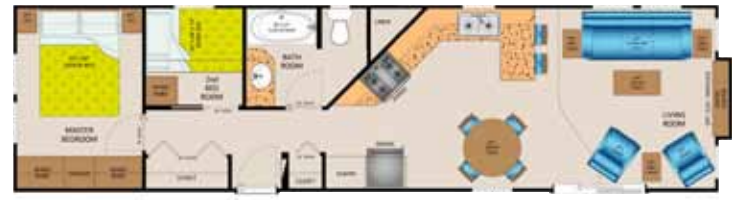
MILLERTON 2 - 18 (M4412 2BR FL) 460 SQ. FT.