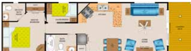
RAVENWOOD - 18 (R4213 FL) 540 SQ. FT.