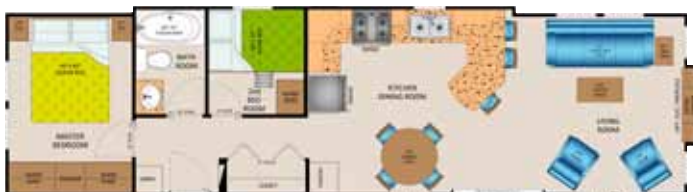
MANCHESTER 2 - 18 (M4512 2BR FL) 539.5 SQ. FT.