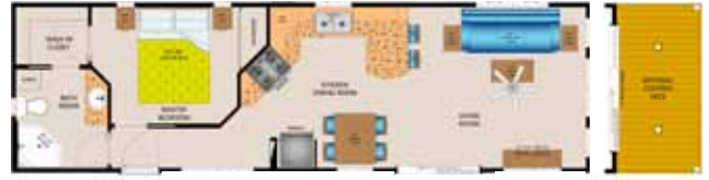
RADISSON - 18 (R4012 1BR FL) 492 SQ. FT.