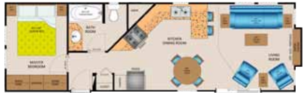
MILLERTON 1 - 18 (M3812 1BR FL) 460 SQ. FT.