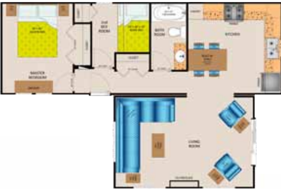
MUSKOKA - 18 (F3612 2BR FK) 426 SQ. FT. + 213 SQ. FT.