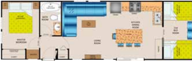
MARTENSVILLE - 18 (M4213 2BR) 533 SQ. FT.