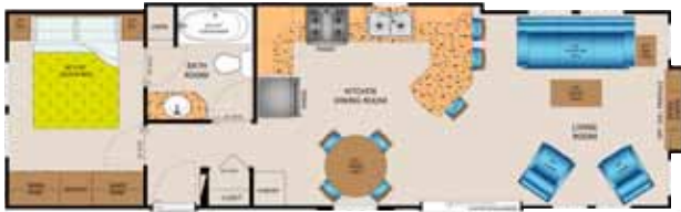
MANCHESTER 1 - 18 (M4012 1BR FL) 491 SQ. FT.