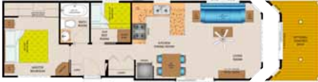
RIVERVIEW - 18 (R4012 2BR FL) 493 SQ. FT.