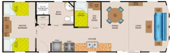
MONCTON - 18 (M4213 2BR FL) 533 SQ. FT.