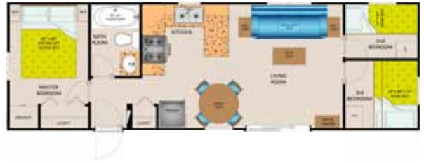
FREDERICTON - 17 (F3812 2BR CK) 450 SQ. FT.