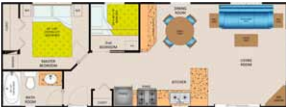
FONTHILL - 18 (F3714 2BR CK) 502 SQ. FT.