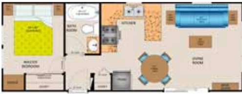
MARICOURT - 18 (M3212 1BR) 379 SQ. FT.