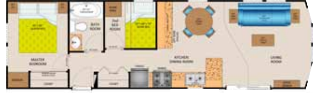
MAITLAND - 18 (M4012 2BR FL) 481 SQ. FT.