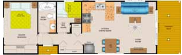
RENFREW - 18 (R3914 2BR FL) 540 SQ. FT.