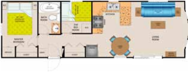
FENWICK - 18 (F3812 2BR FL) 454 SQ. FT.