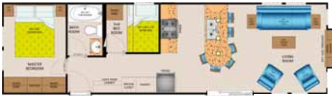
MIDDLETON - 18 (M4212 1BR FL) 515 SQ. FT.